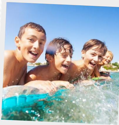
Creating lifelong friendships