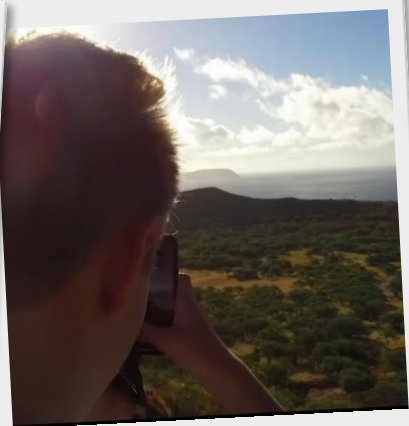
Expand your horizons